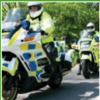
More bikes to support patrols page 4