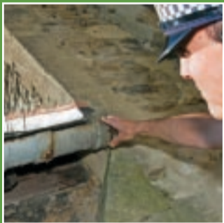
Disrupting metal thieves page 3