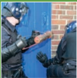
Even better response page 7